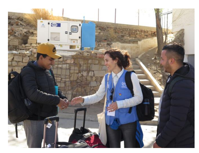
Venezuelans receiving orientation at the border in La Quiaca