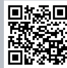
For more information, click here