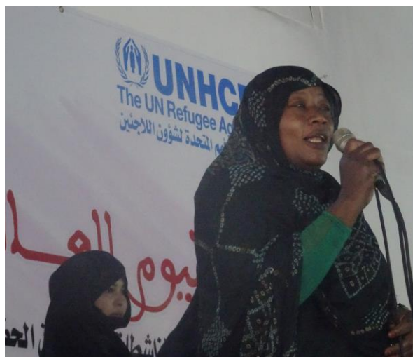
Musical performance during the celebration of International Women's Day, 8 March, Awserd camp.