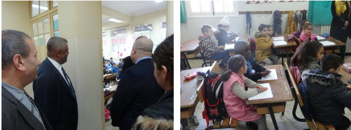
L) The Representative at Cheikh Bouamama School; R) children in the classroom, Cheikh Bouamama School. https://twitter.com/unhcralgeria/status/953641505369059328