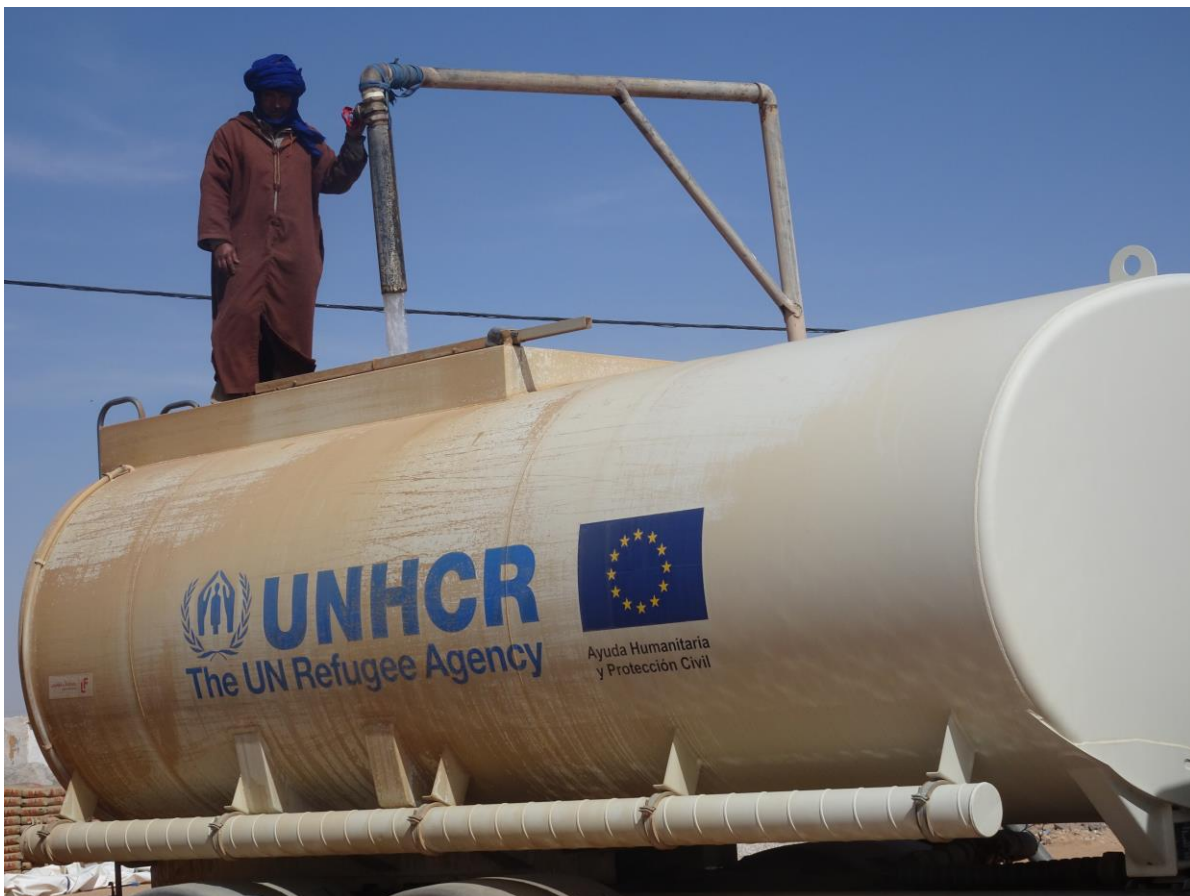
Water distribution in Awserd camp. https://twitter.com/unhcralgeria/status/963492666007842816