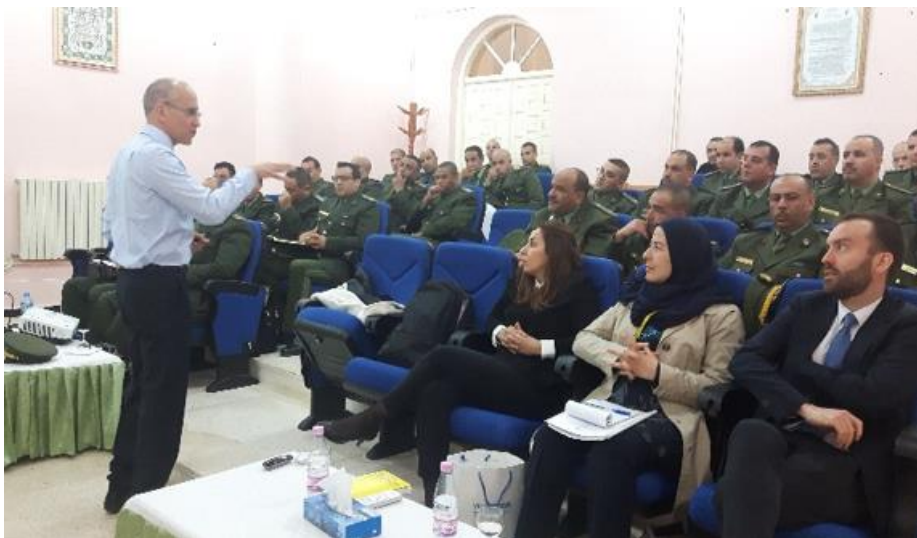
Training for the Gendarmerie.