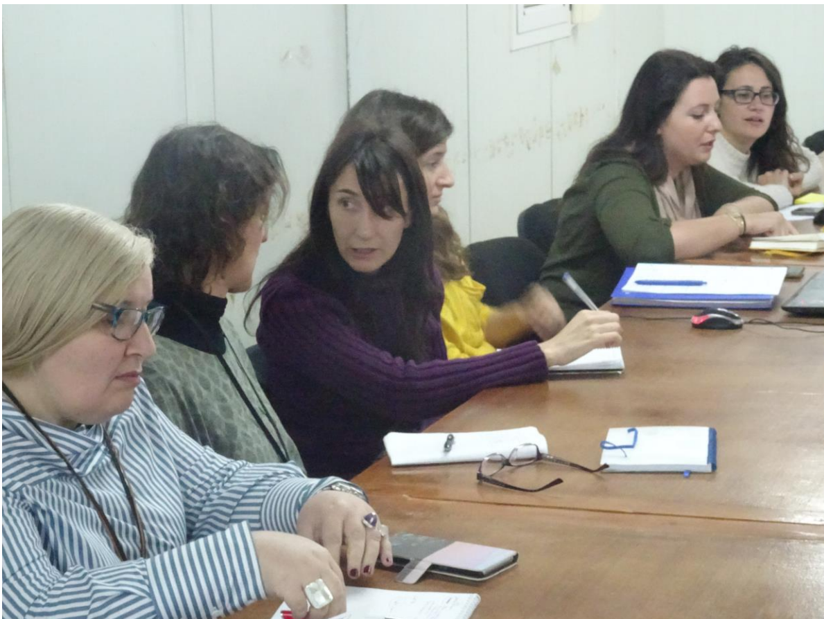
Participants at Inter-Agency Working Group Meeting in Rabouni, February.