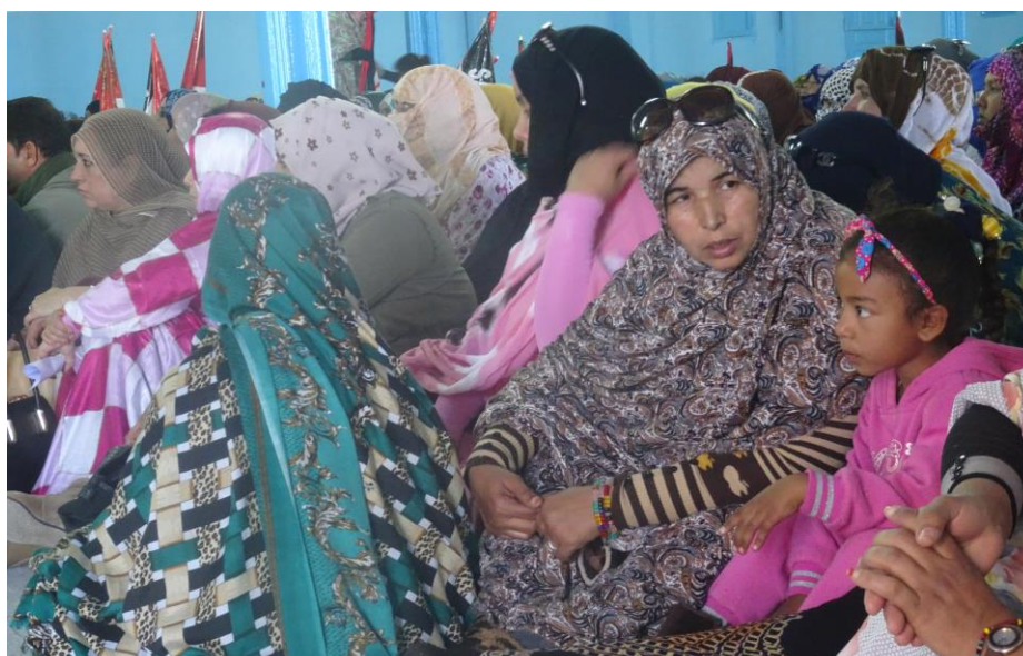
Participants at the celebration of International Women’s Day, 8 March, Awserd camp.

■ On 7 and 8 March, UNHCR celebrated International Women’s Day jointly with UNICEF and WFP in close collaboration with the refugee community. On 7 March, UNHCR partner InfoCom organized a workshop with focus group discussions with participants from the three vocational centers, to review the management recommendations raised during the annual inspection conducted. On 8 March, International Women’s Day was celebrated the cultural club in Awserd camp. Around 250 women attended the event.