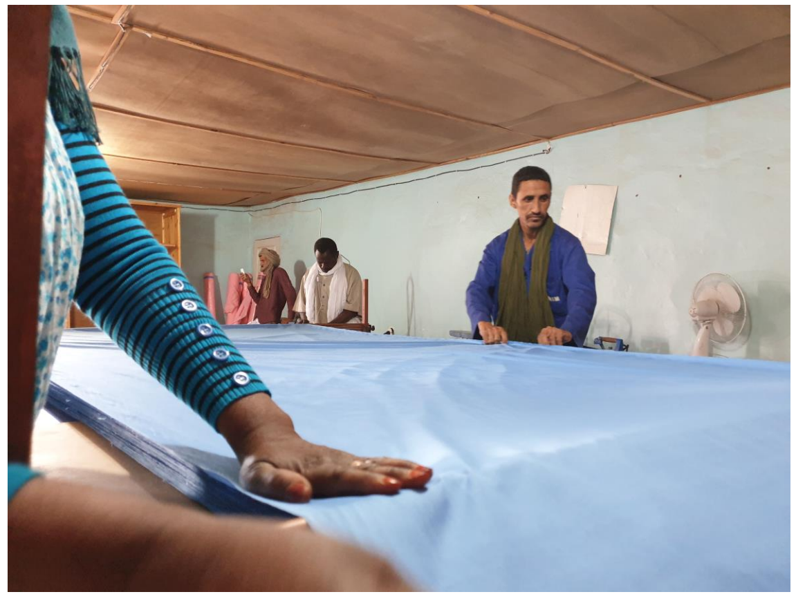
Sahrawi workers in the Boujdour sewing workshop.

UNHCR partner Association Femmes Algériennes pour le Développement (AFAD) provided raw materials and maintained eight sewing machines in the sewing workshop at Boujdour camp. ARC also provided raw materials and sewing machines for the two youth centres, in Dakhla and Awserd camps.