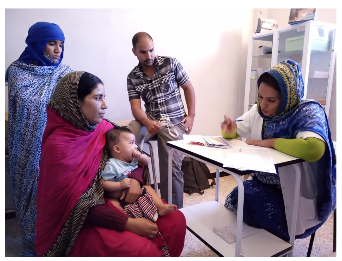
A junior nurse carries out a consultation for an 18-month old infant in Awserd camp.