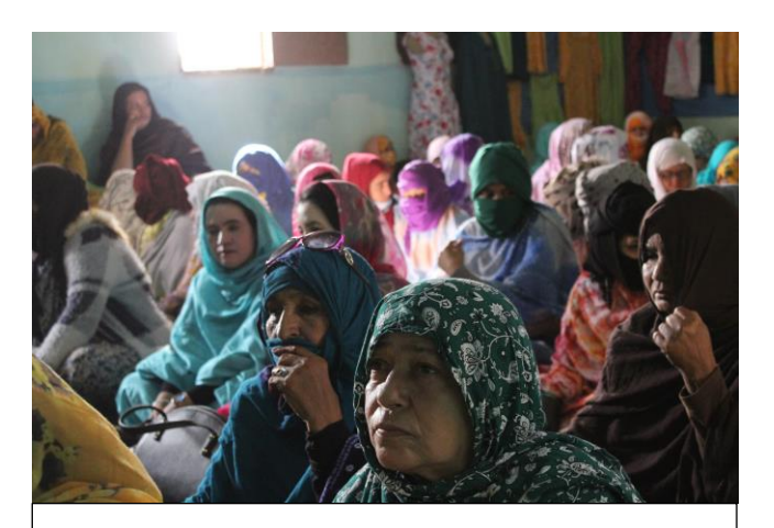
Celebration of International Women's Day in Awserd Camp.