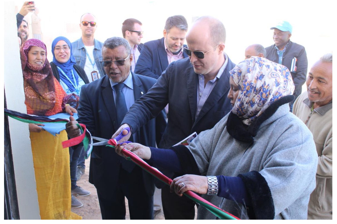
Inauguration of tent sewing workshop.

Responding to the need mentioned below, UNHCR in February inaugurated and equipped a tent sewing workshop in Awserd camp in order to help the refugees sew their tents at reasonable prices and also transmit to younger generations the knowledge on how to sew the fabrics making up the traditional Sahrawi-style family tents.