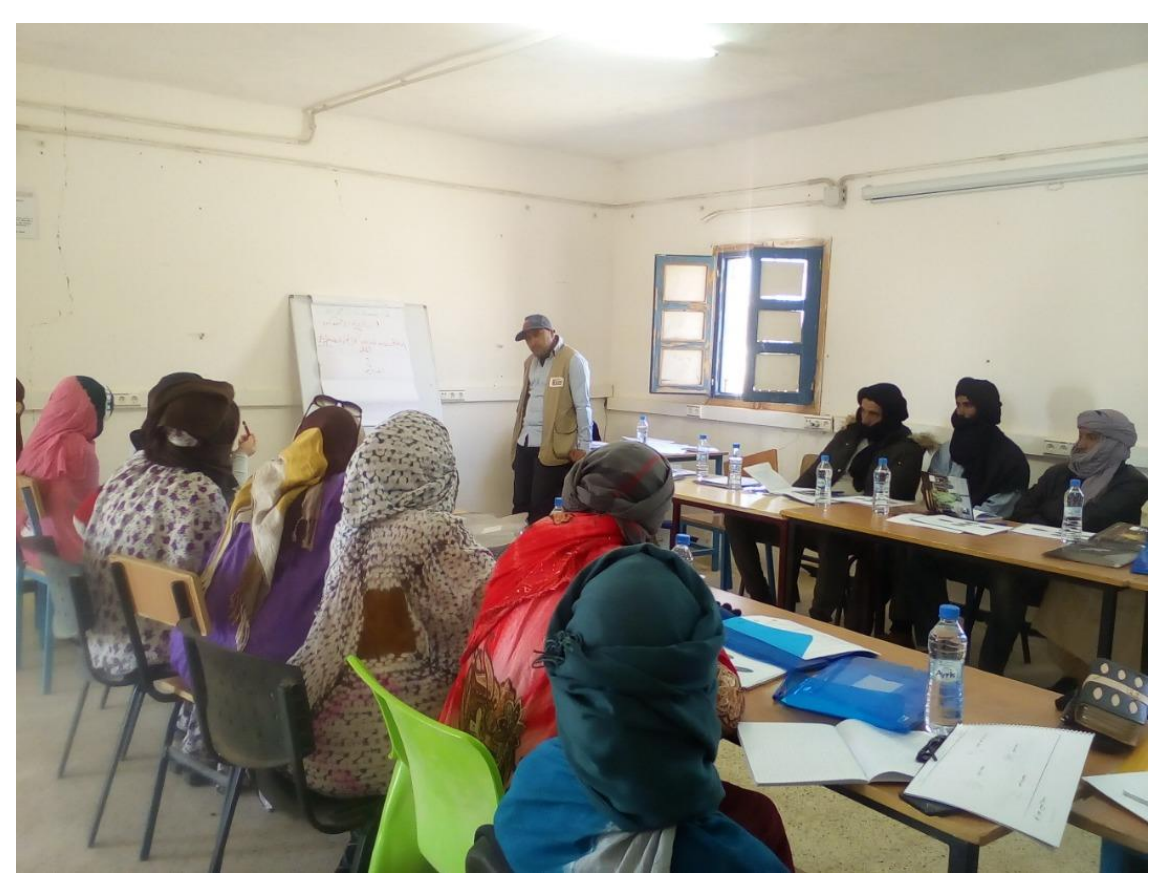
Business management training in Dakhla camp.