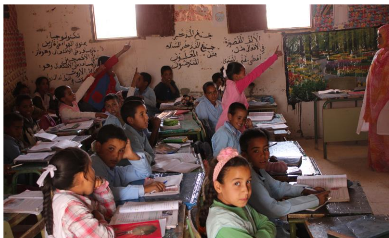
Students of Cantabria primary school in Laayoune camp