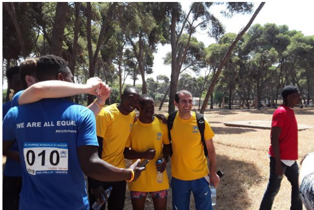
Relay Race as part of the UNHCR global campaign #StepWithRefugees during celebration of World Refugee Day in Algiers

UNHCR leads the provision of humanitarian assistance to Sahrawi refugees, which involves coordination with all humanitarian actors in Tindouf.