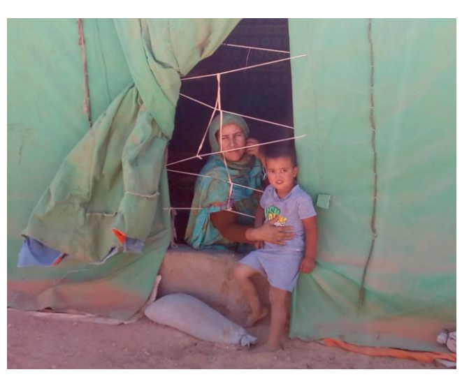
Shelter remains a critical need for Sahrawi families.

UNHCR leads the provision of assistance humanitarian refugees, Sahrawi involves coordination with all humanitarian actors Tindouf.