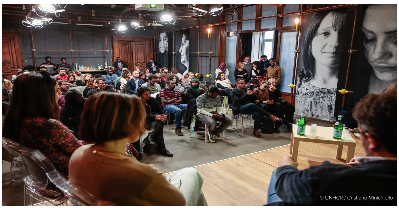
PartecipAzione networking event in Italy.

Following a successful pilot period in 2018, partnership continued with INTERSOS in Italy in 2019 to support refugee-led organisations and initiatives promoting refugee participation. Aptly entitled "PartecipAzione", the programme supported projects which enhance organisational capacity, promote social cohesion and/ or strengthen opportunities for integration. The receipt of 92 project proposals speaks to the popularity of the initiative. Of these, 16 received funding for project activities and training, for example in communication, fundraising, project management and international protection. Winning organisations also participated in networking events to strengthen relationships between community-led organisations. Selected projects were diverse, ranging from historical and cultural tours for asylum-seekers and refugees, to information and legal counselling and story-telling events. More information about the 2019 project outcomes can be found in this video.