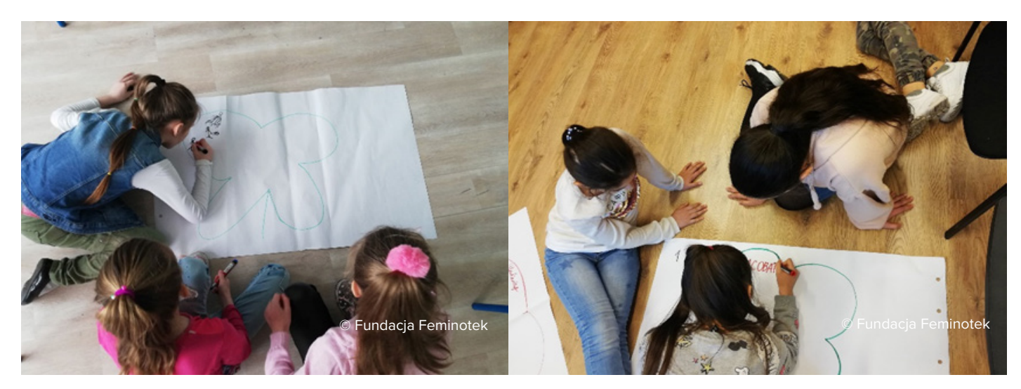
Girls participating in SGBV awareness-raising activities in Poland.

In Georgia a multi-service community center provides SGBV prevention and response activities, including legal and social counselling, cash-based interventions, psycho-social support, life skills and language courses and awareness sessions. In addition, UNHCR and UN Women facilitated a two-day workshop for state asylum, integration and SGBV service providers, civil society and refugee women. The workshop enabled information exchange and the identification of challenges to strengthen a coordinated response. Participants also finalised information material on SGBV services for persons of concern.