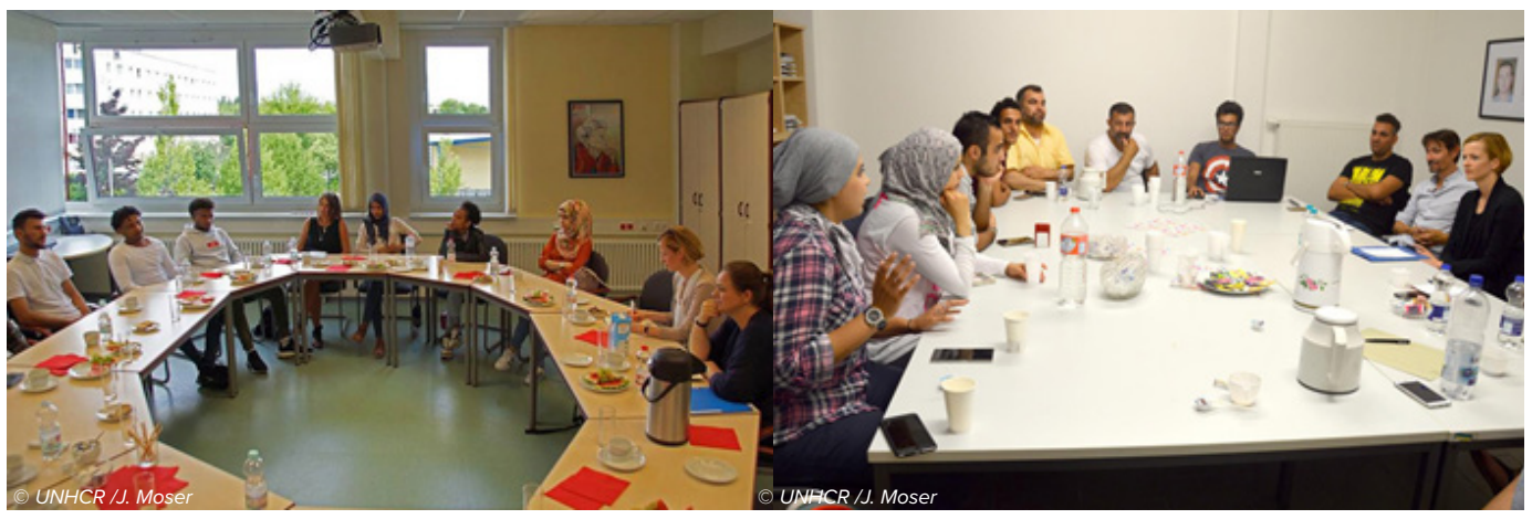
Participatory assessments through community outreach in Germany

phase of pilot projects to enhance community outreach were used to inform subsequent measures, and led to different interventions than originally planned, as detailed below.