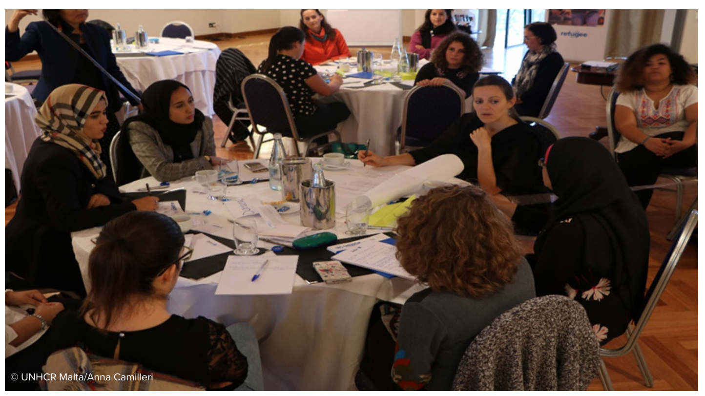
Discussions during an SGBV Roundtable in Malta.

that there is more advocacy and engagement on refugee issues through organisations which are not led by refugees due to their stronger capacity and sustained funding. For this reason, a second phase of the project has commenced, where the office will assess refugee engagement at the municipal level in four locations with a high concentration of refugees, with the objective of ultimately recommending measures to strengthen community engagement of municipal actors with refugees.