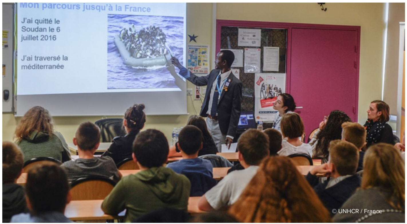
Awareness sessions led by refugees in French schools.

In Bosnia and Herzegovina , UNHCR actively engaged members of Roma communities to build trust and facilitate identification of individuals requiring assistance in obtaining birth registration and confirmation of citizenship. In cooperation with municipal level authorities, the legal aid NGO Vasa Prava BiH and Roma representatives organized focus group discussions to emphasize the importance of birth and citizenship registration for all persons at risk of statelessness. Roma mediators conducted outreach, providing infor-