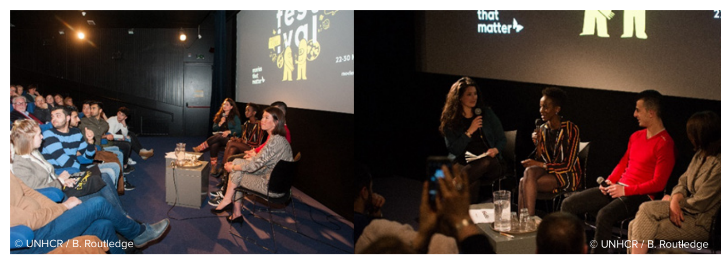
UNHCR Netherlands event to highlight the situation of unaccompanied and separated children, featuring a screening of a documentary about a young refugee adapting to life in Hungary, after fleeing forced marriage in Somalia, followed by a panel discussion.

finalised by the Ministry, in coordination with the Institute for Social Affairs, in December 2019.