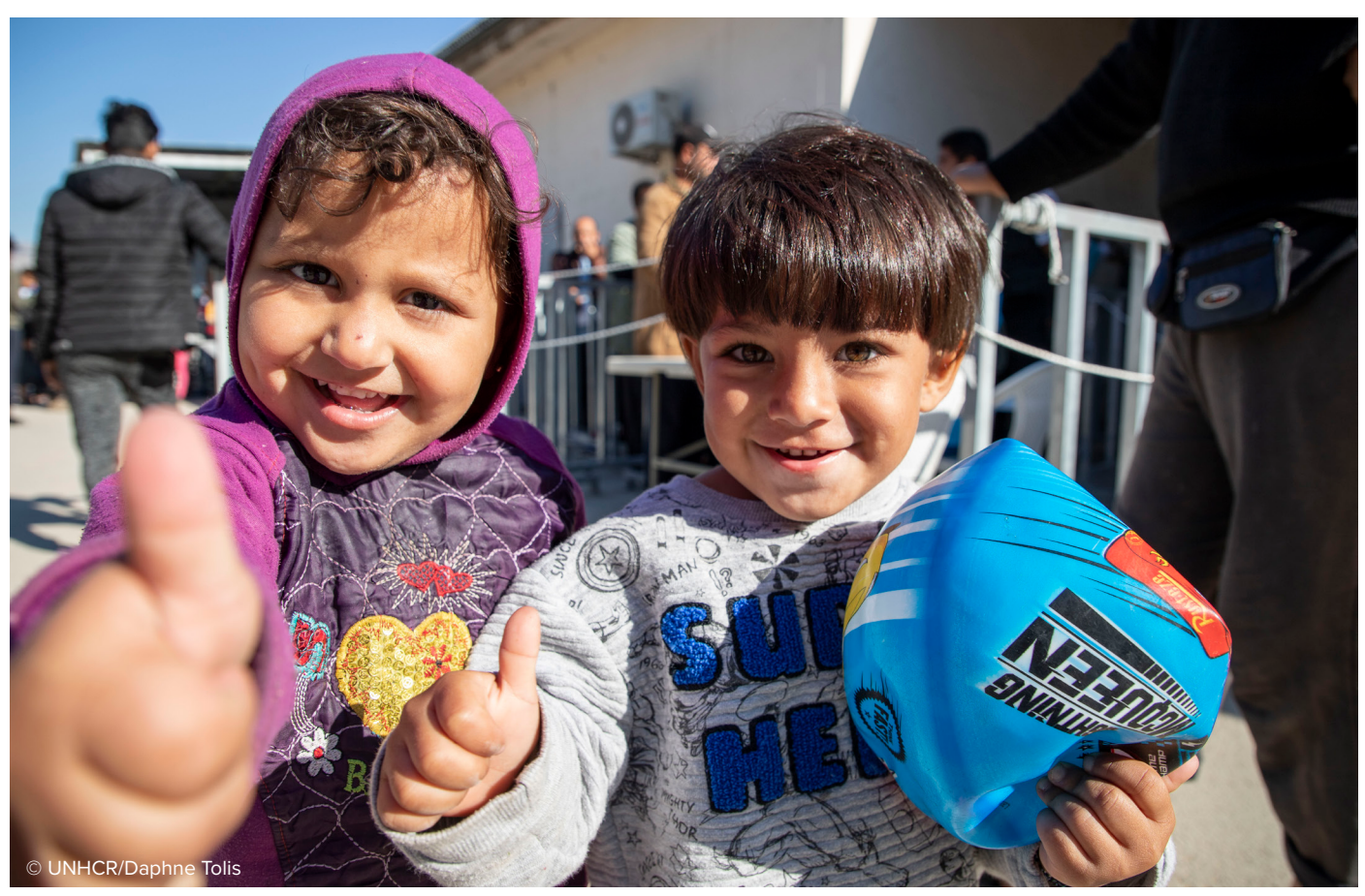
Syrian children give the thumbs-up at the government-run Vial reception centre on the island of Chios.

including Austria, Belgium, France, Germany, Luxembourg, the Netherlands and the United Kingdom. The project was implemented between November 2017 and June 2019, aiming to strengthen best interests' procedures for children of concern and improve reception systems for UASC at regional and national level. Various activities were completed through this initiative including promoting access to national child protection systems, the development of handbooks and training material for guardians, assessment and monitoring of reception conditions and care arrangements, and support for child-friendly asylum procedures. Children themselves were consulted through each stage of the project in all participating countries.