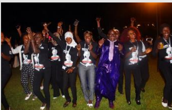
On the evening of the third day, celebrating the validation of the Banjul Plan of Action

The validation of the Banjul Plan of Action drew the attention of national, African and international medias. Further articles and media resources are available here . Two videos also offer a unique insight into the expert meeting and ministerial meeting .