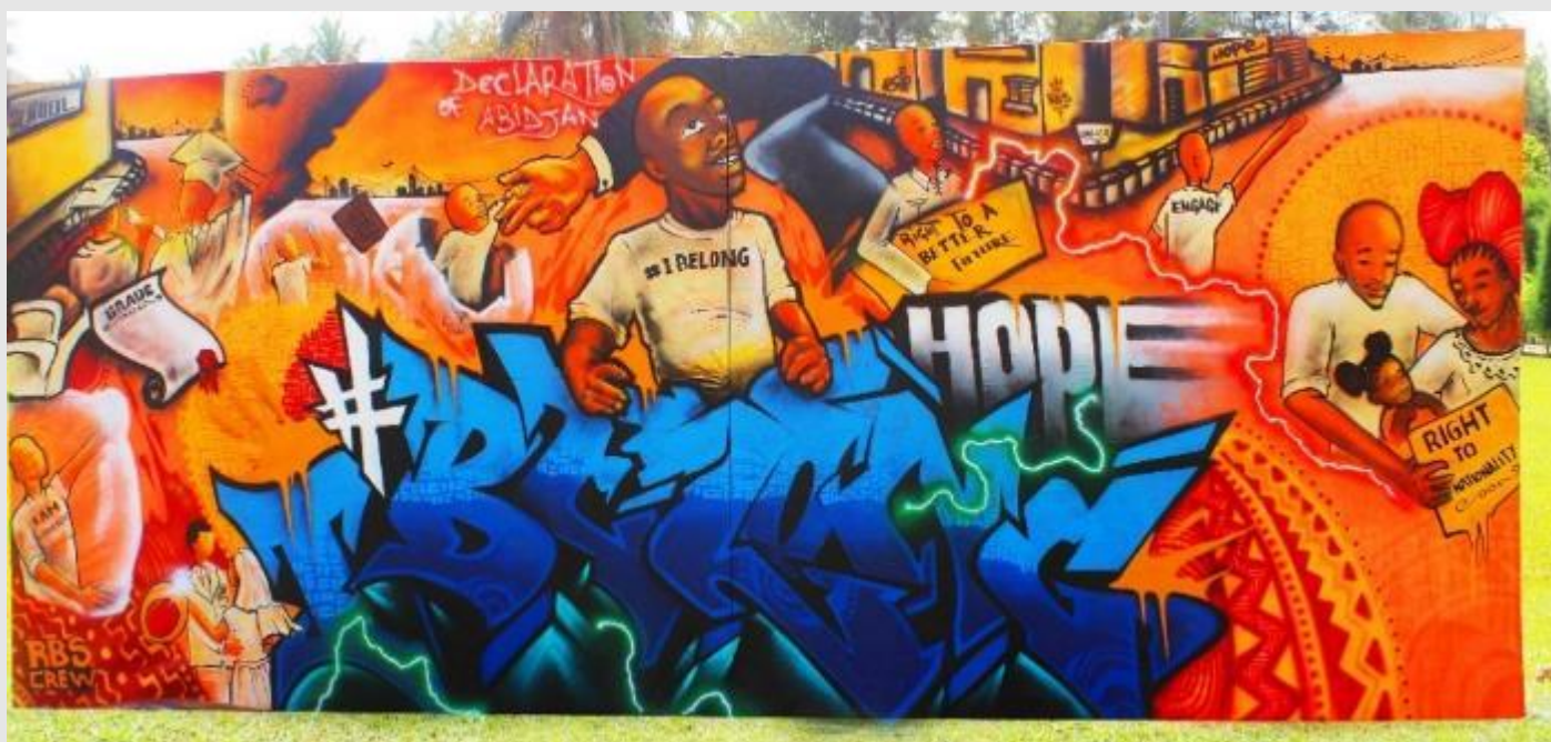
Graffiti wall painted during the Ministerial Meeting and signed by all participants

High-level participants included the Vice-President of the Gambia, Ms. Fatoumata Jallow Tambajang, who commended the region’s determination “to address the root causes of statelessness”; the Special Representative of the UN Secretary General for West Africa and the Sahel, Dr. Mohamed Ibn Chambas, who stressed the importance of putting in place a robust regional institutional and legal framework to eradicate statelessness; the Assistant High Commissioner for Refugees (Protection), Mr. Volker Türk, who highlighted the exemplary commitment of the ECOWAS Member States in validating this “unique and inspiring” plan of action .