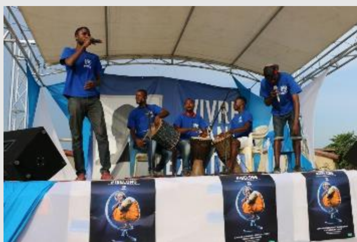
Open-air sensitization activities on statelessness

Côte d'Ivoire – On 21 April 2017, UNHCR launched a large-scale, roving awareness-raising campaign. The caravan travelled throughout the country and made stops in Abidjan, San Pedro, Bouaké, Bondoukou, Korhogo, and Odiénne. In order to raise public interest, UNHCR insisted on interaction and entertainment. Awareness messages on statelessness were delivered through musical, dance and theatrical performances, film projections and Q&A sessions with the public. The activities, which were attended by more than 300 spectators, drew the attention of the local media and television.