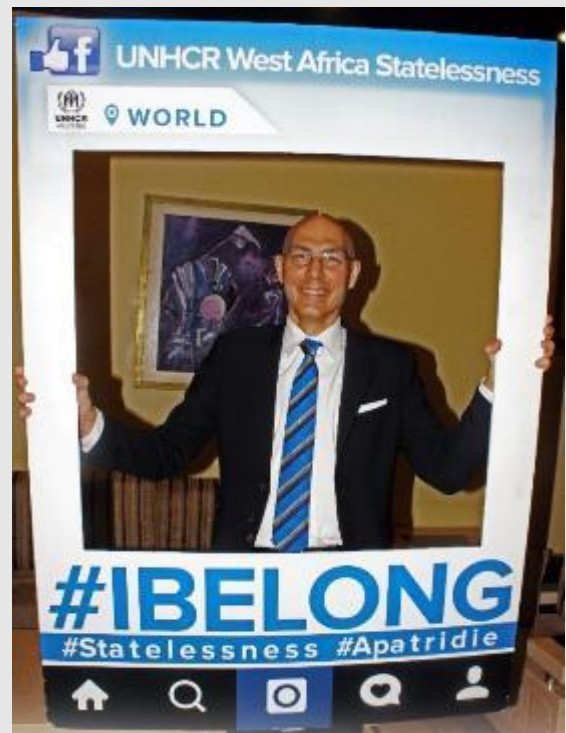
Mr. Volker Türk, Assistant High Commissioner for Refugees (Protection)

Representatives of other international organizations, such as UNICEF, UNFPA and the World Bank, were also present and reaffirmed their commitment in the fight against statelessness.