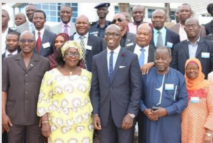
The Minister of Interior of Sierra Leone surrounded by the participants

Sierra Leone developed a National Plan of Action for the eradication of statelessness at a three-day workshop organised by the Ministry of Interior, with the support of UNHCR and the National Commission for Human Rights. The event was attended by the President and representatives of the Parliament, key ministries and civil society. The workshop was opened by the Minister of Interior, who underscored the critical importance of the fight against statelessness.