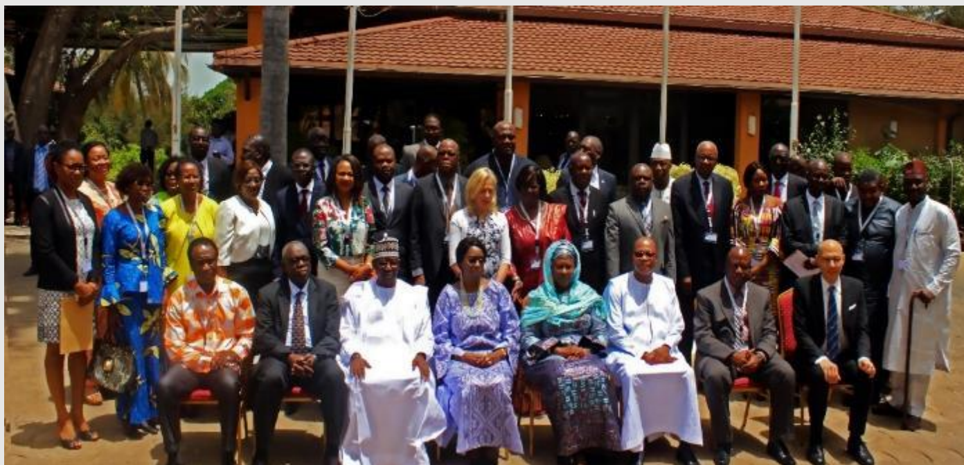
Participants at the ministerial meeting.