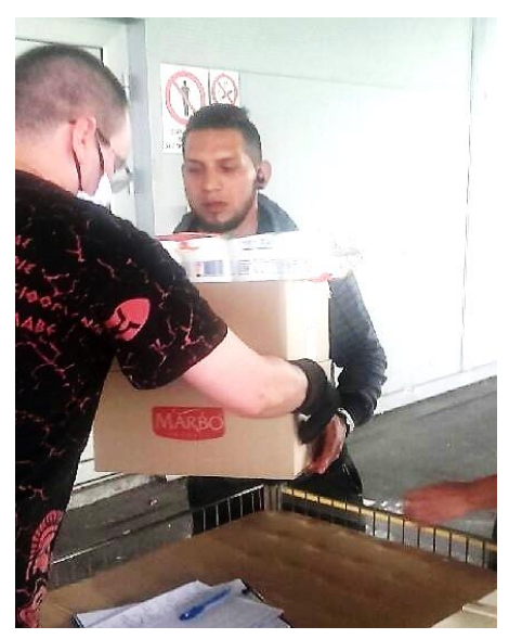
Distribution of food and hygiene parcels in Kraljevo, ©Indigo, May 2020