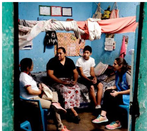
Children of Peace project - Villanueva, Guatemala 2016