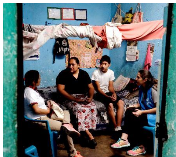
Children of Peace project - Villanueva, Guatemala 2016