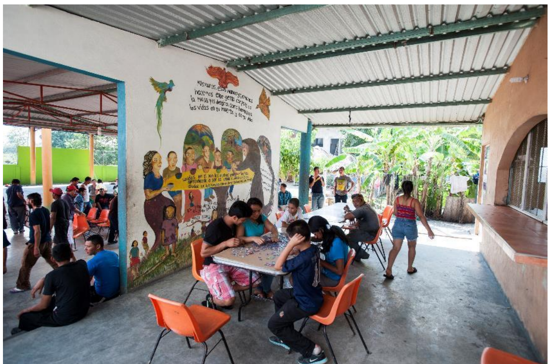
The UNHCR funded LA 72 shelter in southern Mexico.