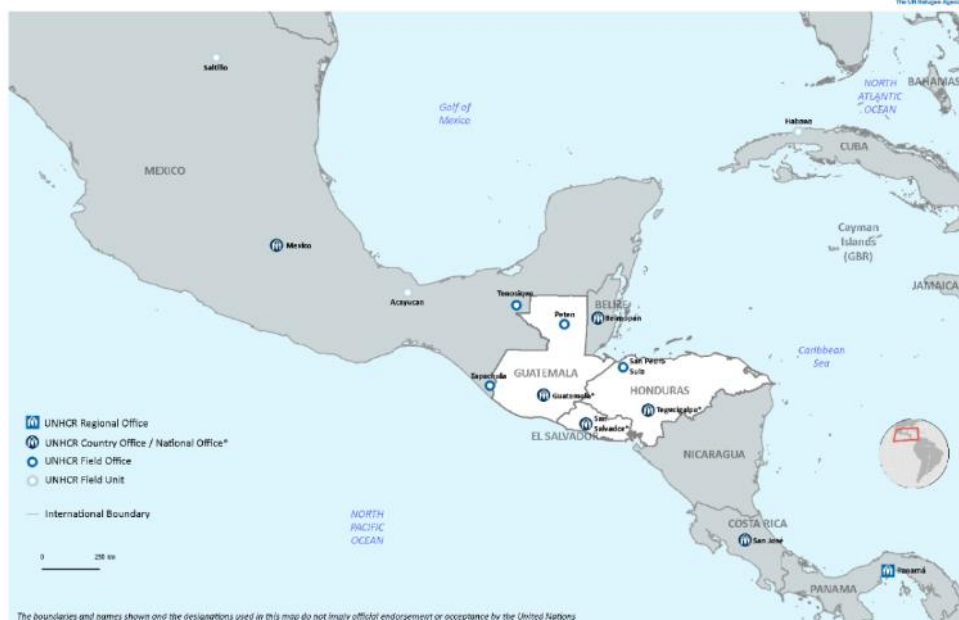
Northern Triangle of Central America (NTCA) Situation: UNHCR Presence, as of November 2016