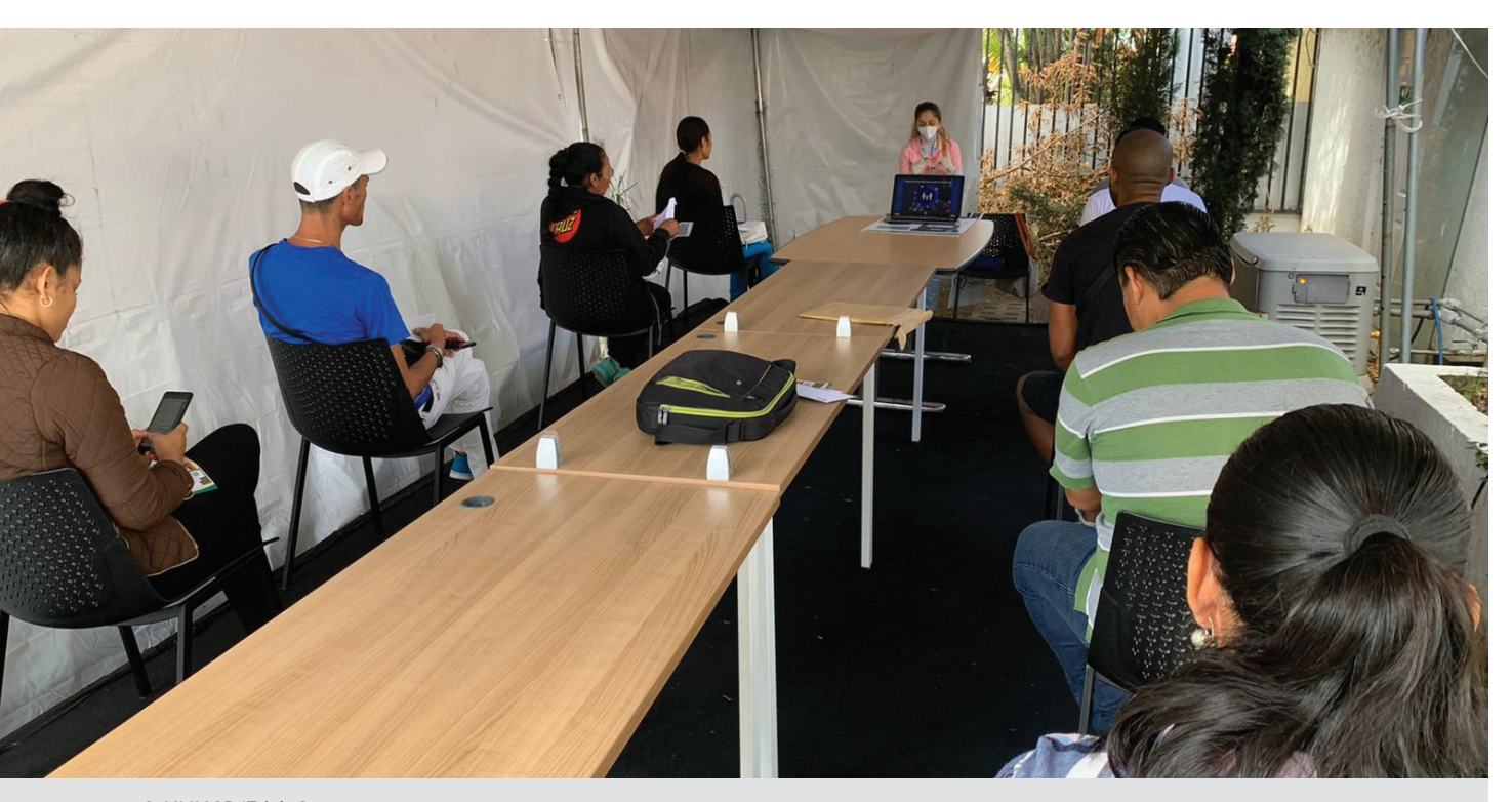
Preparing to assist the most vulnerable in Costa Rica

The transfer value will depend on family size. Families with elderly (family members over 60 years) and with documented chronic medical conditions will receive monthly payments for the duration of the crisis. In addition to contact details in PRIMES, UNHCR will use a range of communication channels with the beneficiaries to inform them of this opportunity, including social media campaigns, broadcast SMS messages and outreach through community leaders.