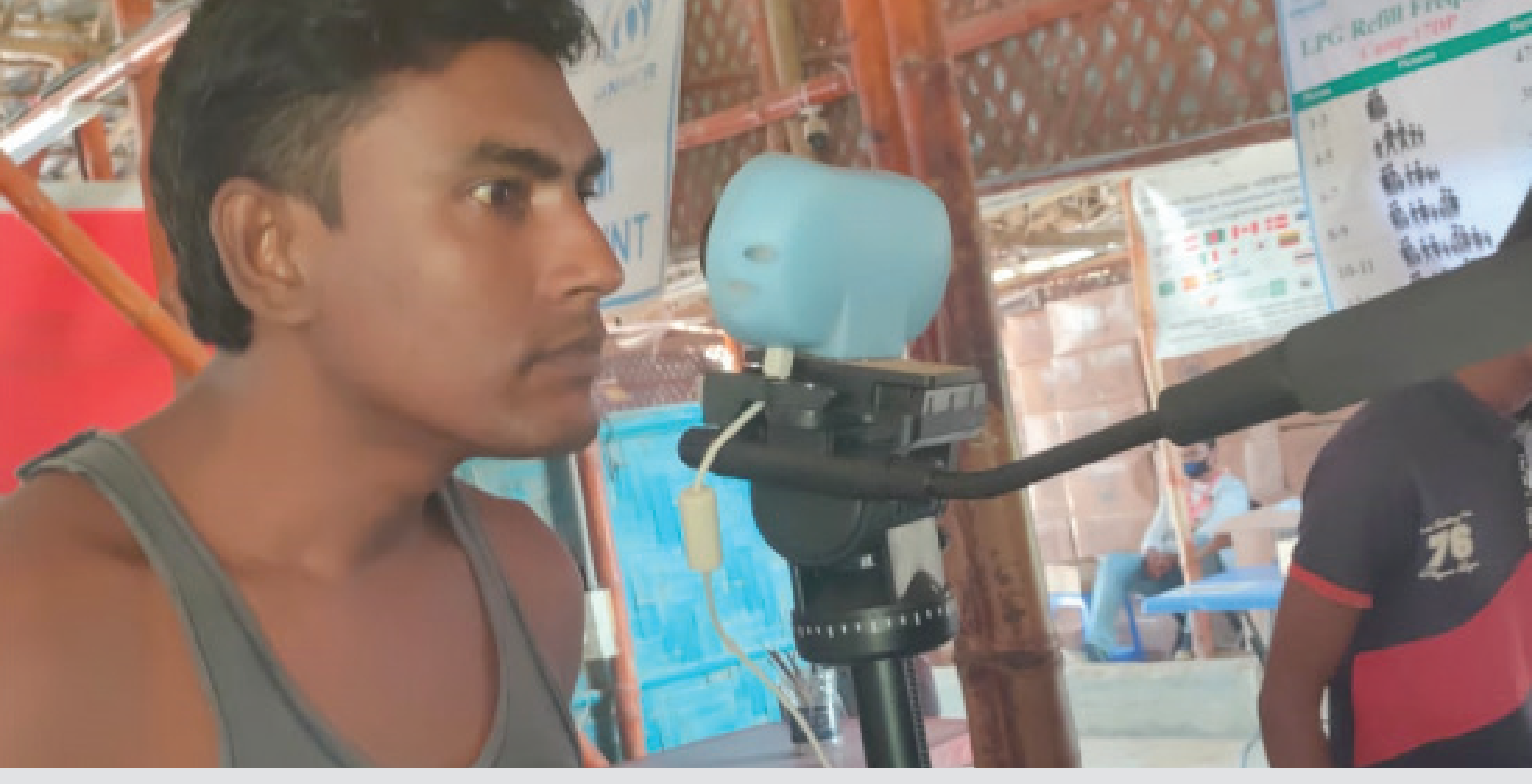
Testing contactless biometrics in Bangladesh