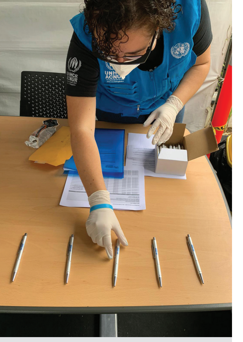
Preparing to assist the most vulnerable in Costa Rica