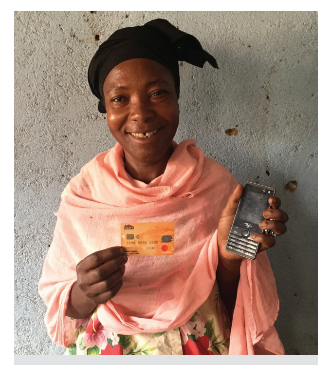
Digital payments in Uganda

The government of Morocco has declared a state of national health emergency responding to the increasing number of persons contracted COVID-19. UNHCR has therefore advanced the payments under the existing cash assistance for the most vulnerable, and reprioritized within the current available funds to support all refugees with a one-time off cash assistance to alleviate the economic impact of COVID-19.