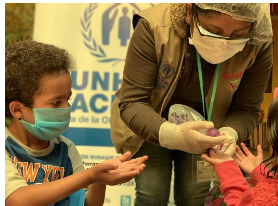
Photo: Sensitization session on hands washing with children