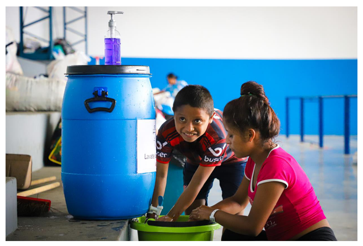
Indigenous Warao refugees from Venezuela wash their hands, having been relocated to a safe shelter in Manaus, northern Brazil.