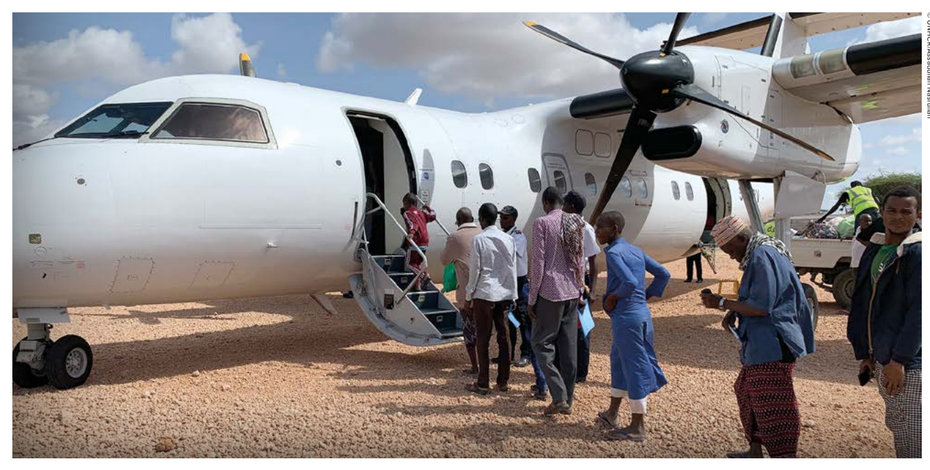
Somali refugees boarding a plane that will take them back to Somalia from Dadaab, Kenya. More than 80,000 Somali refugees have returned home from Dadaab since UNHCR started its voluntary repatriation programme in December 2014.