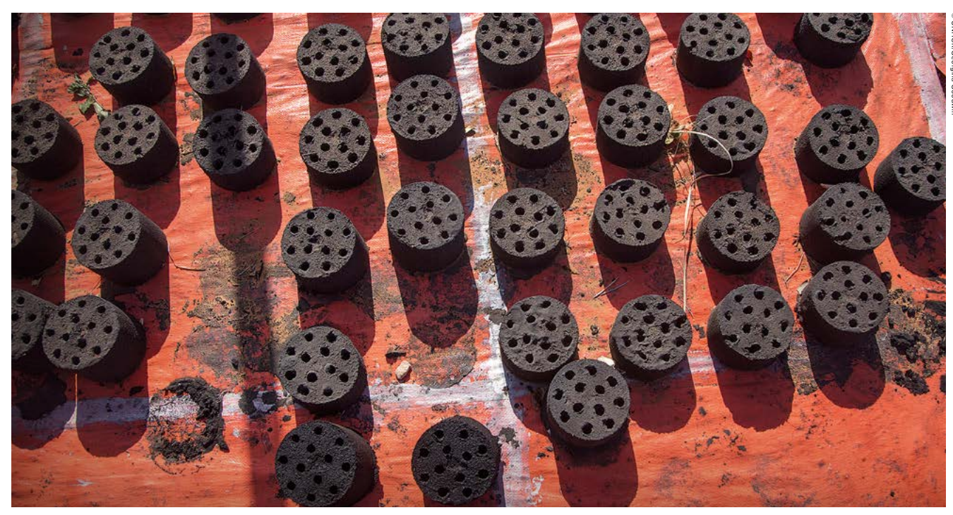
The Prosopis Firewood Processing and Charcoal Briquette Production Scheme in Melkadida Camp, Ethiopia, provides alternative fuel options to reduce deforestation and pollution.